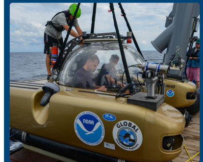
Image courtesy of John McCord UNC CSI – Battle of the Atlantic expedition.